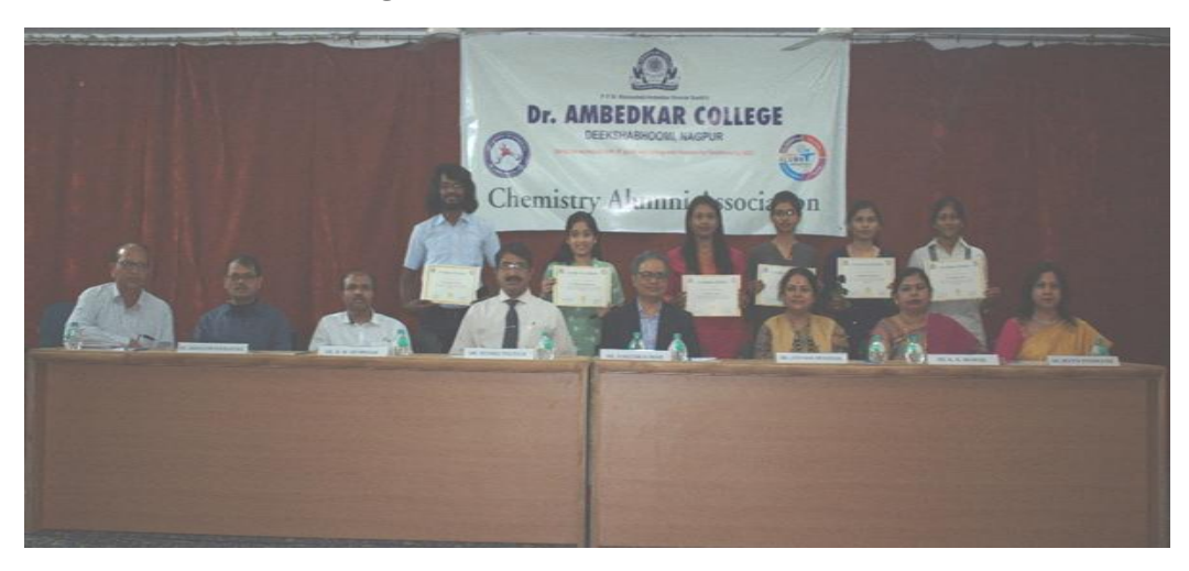
Pic 2: Dignitaries with felicitated MSc and BSc toppers